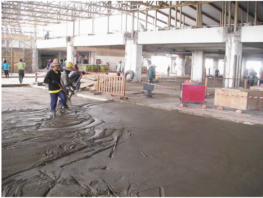
Fig. 3. Foamed concrete used as underlayment and slab thickening for air port

variety of challenges in construction, mining and manufacturing applications. Figs. 3 and 4 are examples of foamed concrete applications for infrastructural developmental works as presented in [19].