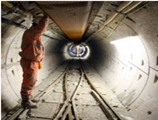
Fig. 4. Peacehaven treatment works.