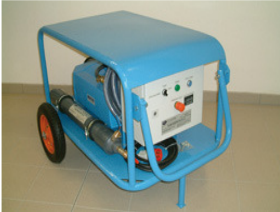
Fig. 2(a). Foam generator

[9]: LithoPore® - German advanced cellular lightweight concrete technologies