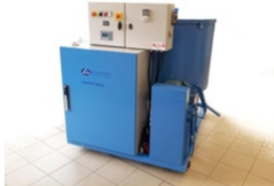
Fig. 2(b). Complete foamed concrete machine

[9]: LithoPore® - German advanced cellular lightweight concrete technologies