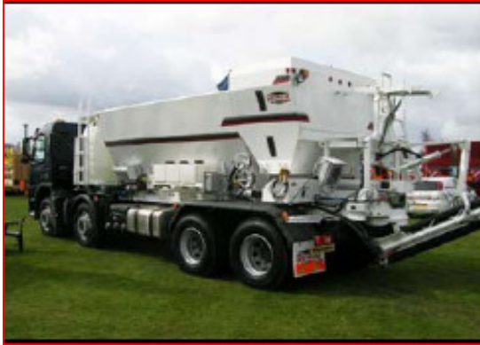
Fig. 6. Reimer R12 utility vehicle for foamed concrete production

The above are just being referenced to highlight that there are opportunities for groundbreaking research and development works. Africa also needs to take advantage of this development.