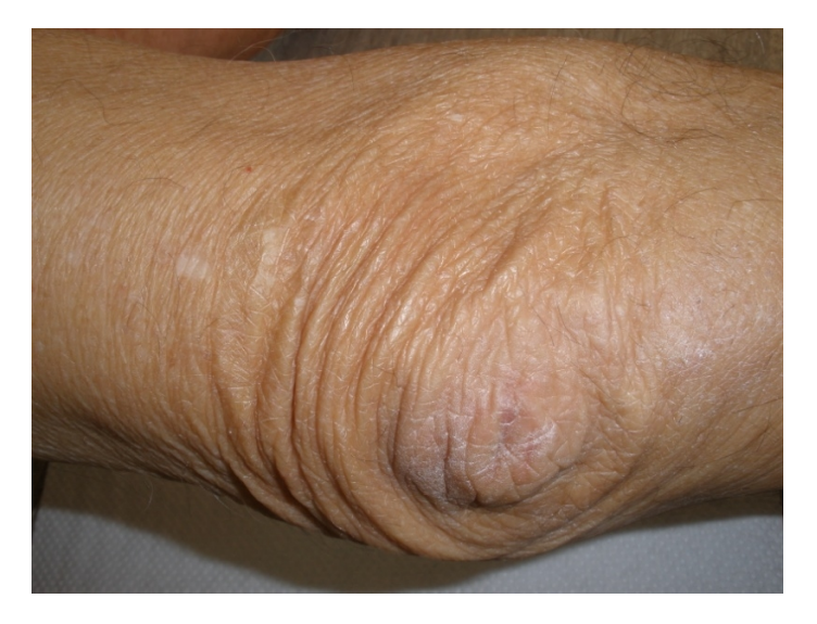
Fig. 1c. No recurrence or complications were encountered 3 years post-operatively