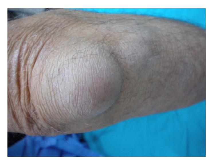
Fig. 1a. Nonseptic olecranon bursitis in a 70-year-old man

The long-term follow-up ranged from 2 to 10 years (average 5 years). All patients were contacted by telephone. A follow-up appointment was arranged only in 3 patients who exhibited the longest wound healing period (Fig 1c). No skin problems, pain or recurrences were encountered. None of the patients reported any restriction of movement at the elbow joint.