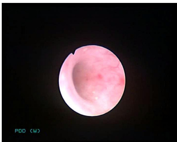
Figure 2 WLU of the same area as in Fig. 1, showing two lesions.

WLC found that PDD is more effective than WLC for detecting malignant bladder lesions and CIS, in addition to having a more complete resection during TURBT [7]. Furthermore, two of these randomised controlled trials found that PDD-TURBT increases the recurrence-free survival of patients with non-muscle-invasive cancers [7].