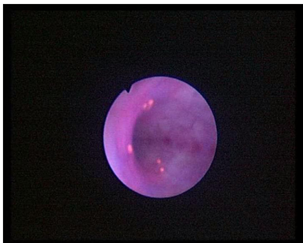
Figure 1 PDD using blue light, showing five areas of abnormal tissue.