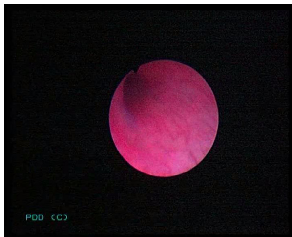
Figure 3 PDD showing a single area of CIS.

However, these high sensitivities were all reported for bladder tissue, and a thorough search of previous reports failed to identify any studies reporting the use of PDD in the UUT, other than two case series of four patients each [4,14], one of which [4] was our initial experience. In this audit, although there was no statistically significant difference between WLU and PDD, PDD detected more lesions and tumours. WLU missed all the CIS and dysplastic lesions, but these were detected with PDD (Figs. 3 and 4). The FP result with WLU was a scar tissue, which was not fluorescent under PDD. While PDD did