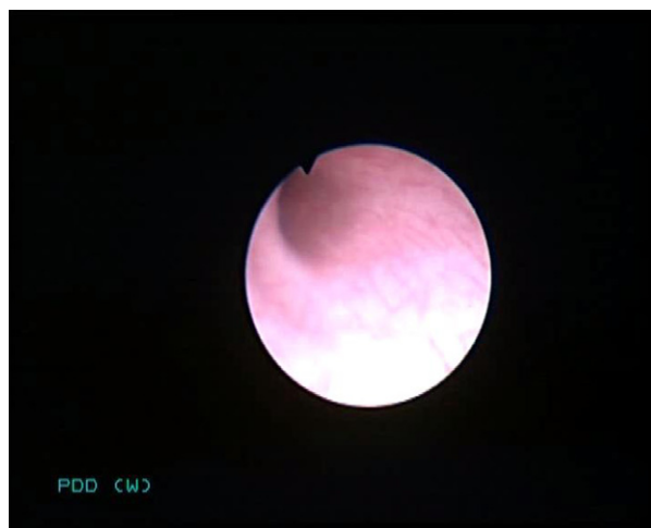
Figure 4 WLU of the same area as in Fig. 3, showing no obvious lesion.

not detect a G3pTa lesion, WLU detected this, but we are unable to explain why there was no fluorescence.