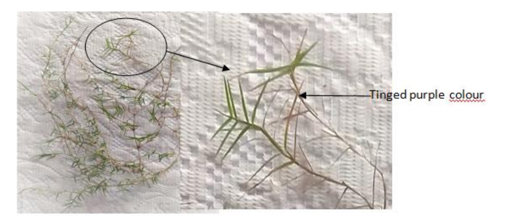
Fig. 1. Cynodon dactylon

C. dactylon is considered a forage crop that is tolerant of close grazing and need minimum management. It also acts as alternative for tall fescue during summer months. It is a versatile grass which can be grazed, haved, and grown together with cool-season plants during dormant season. When season becomes favourable for its growth then, it becomes difficult to grow this plant with other companion forages. In some areas, alfalfa is grown with this grass. Also, Clovers could be grown with this plant, but elevated management is required for the establishment of legume and their persistence. To use this plant as forage crop in all grazing systems, one must determine the proper stocking rate of this plant under grazing management. This plant has great potential in managing grazing animals, forage production would be better if rotational grazing is preferred.