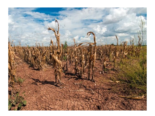
Fig. 2. Effect on soil and crops

directly affects disease transmission by shifting the vector's geographic range and increasing reproductive and biting rates by shortening the pathogen incubation period. Malaria is by far the most important vector-borne disease-causing high morbidity and mortality in Sub-Saharan Africa.