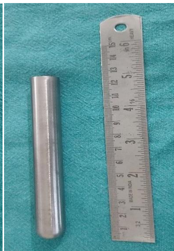
Fig. 6. (Length: 12.5 cm)