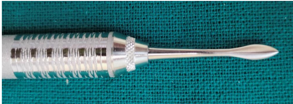
Fig. 4. (Anterior Periotome)