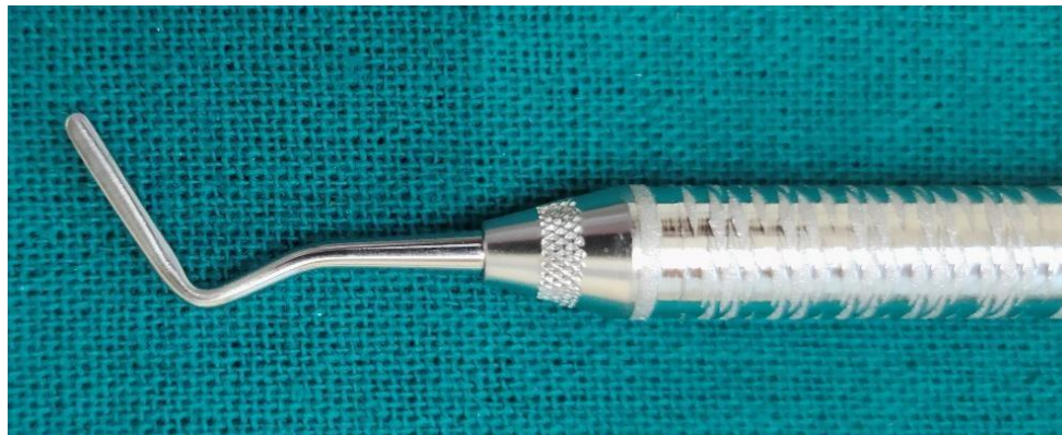
Fig. 2. (Anterior Periotome)