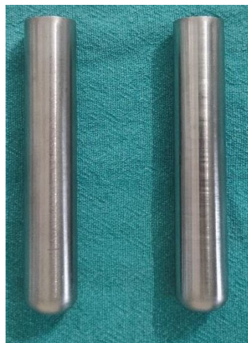
Fig. 5. (Titanium test tubes)

Expected Outcomes: We expect early and better results in healing after socket preservation using T-PRF and DFDBA, which will be advantageous for implant placement. Better results in terms of bone volume, bone height, bone density and histomorphometric results.