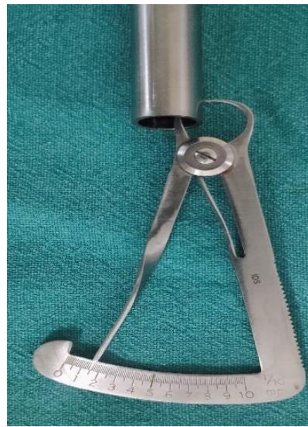
Fig. 8. (Thickness 1.5mm)