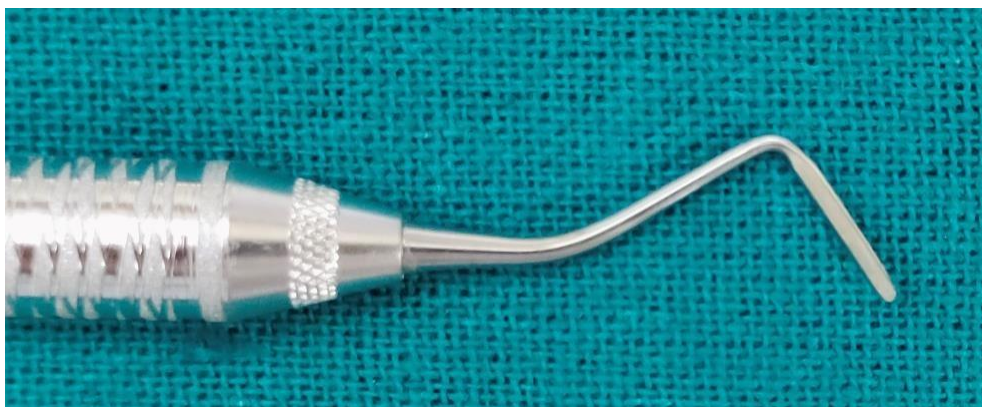
Fig. 3. (Posterior Periotome)