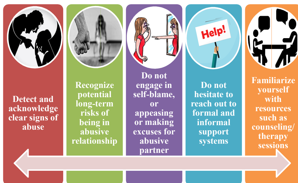
Fig. 3. Pictorial depiction of psychological countermeasures for cyber partner abuse