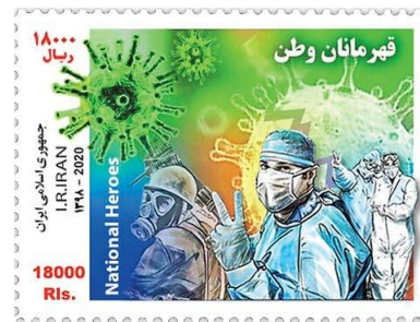
Fig. 3. “COVID-19” stamp, Iran

Coronavirus”, according to other sources - as shown in Fig. 3 [12,13] - was unveiled by President H. Rouhani during a ceremony broadcast by Iranian state news.