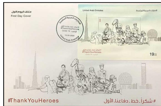
Fig. 15. “COVID-19” first day cover with souvenir sheet, United Arab Emirates