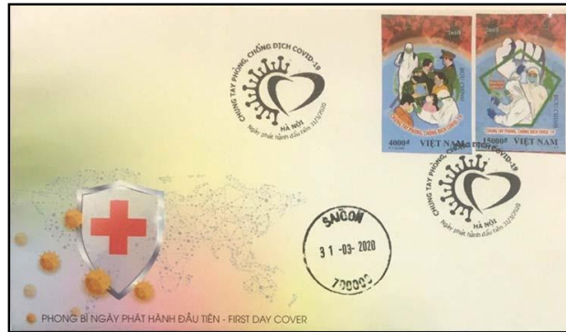
Fig. 5. "COVID-19" first day cover, Vietnam