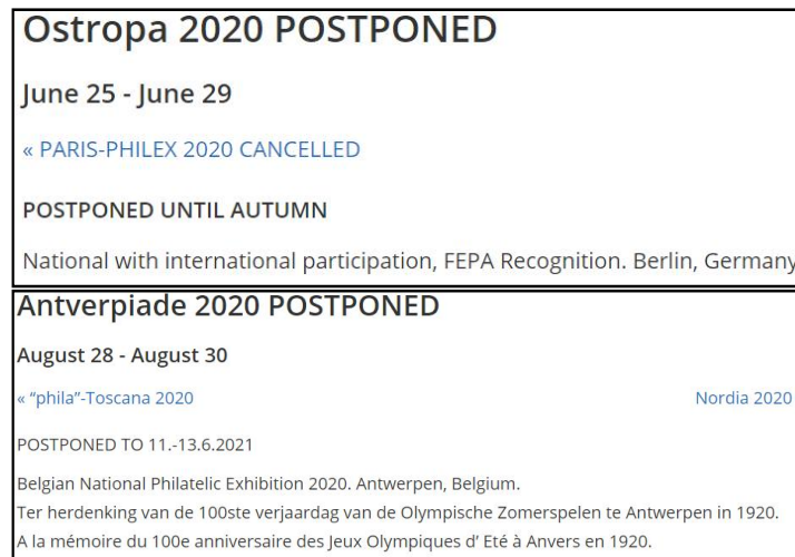
Fig. 2. Examples of messages related to COVID-19 impact on philatelic events

services for a while. Focus now moves to 2021 and most especially the NOTOS 2021 exhibition in Athens. As the NOTOS organizers just announced, they open a “window of optimism” and from April 1, they started taking participation applications using online forms.