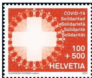
Fig. 8. "COVID-19" stamp, Switzerland

The "COVID-19 Solidarity" stamp reflects Swiss Post's commitment to the society cohesion. Proceeds will go to Swiss Solidarity and the Swiss Red Cross [23]. It is a way for you to support those in urgent need of help.