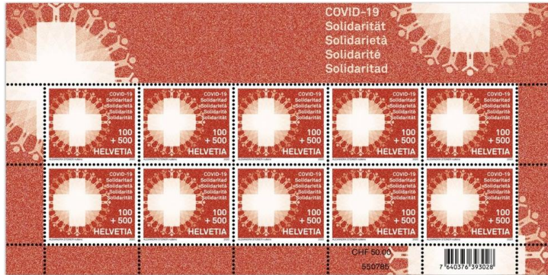
Fig. 9. “COVID-19” booklet of 10 semi-postal stamps, Switzerland

After Iran, Vietnam and Switzerland unveiled their COVID-19 stamps to the world, more and more coronavirus issues have been released by Isle of Man, Kingdom of Morocco, United Arab Emirates and so on [25].