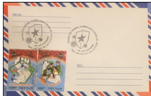
Fig. 7. "COVID-19" postcard, Vietnam