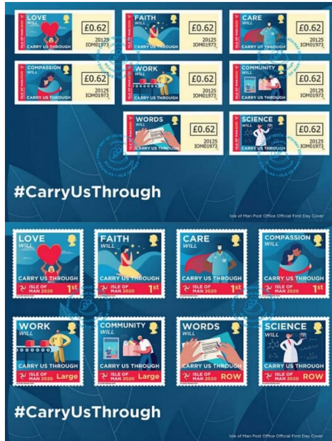
Fig. 12. “COVID-19” first day cover, Isle of Man

disappointment remains that even at this time the Romanian postal administration (Romfilatelia) has not yet issued any postage stamp on this subject. Until now, we do not know that this topic will be addressed by other researchers in the field of philately. The way we chose to structure the information we consider to offer originality to the work and reflect our way of expression.