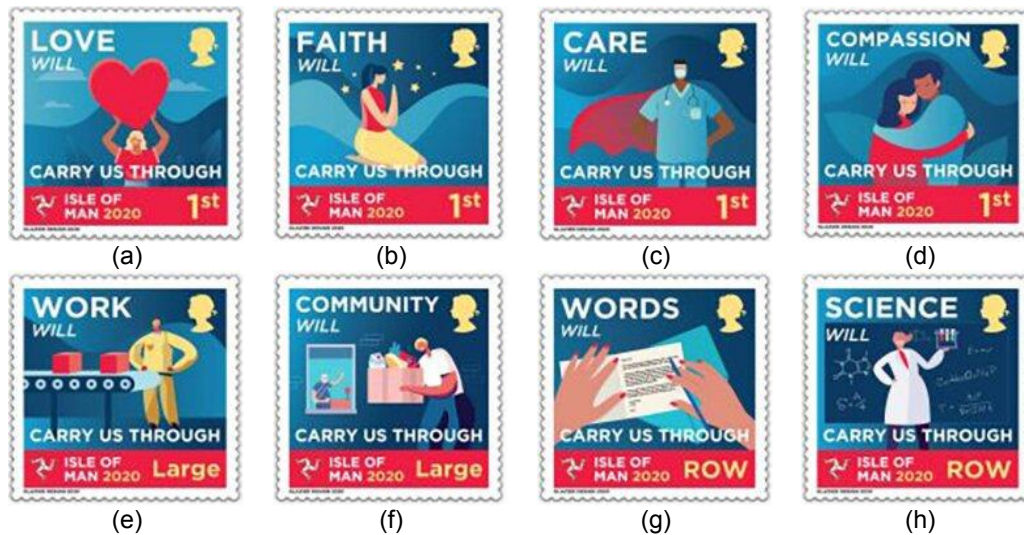
Fig. 11. “COVID-19” stamps, Isle of Man

The Isle of Man stamps - as shown in Fig. 11 [26] - are especially interesting by the fact that they express the “COVID-19 #Carry Us Through Campaign”, referring to the elements with significant impact on hard-to-try community environment, respectively: love (a), faith (b), care (c), compassion (d), work (e), community (f), words (g) and, finally, science (h) [27-29].