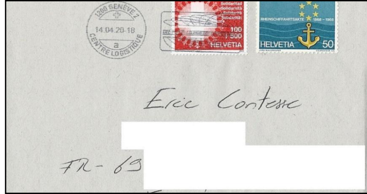
Fig. 10. “COVID-19” circulated issue, Switzerland-France, 14 April 2020