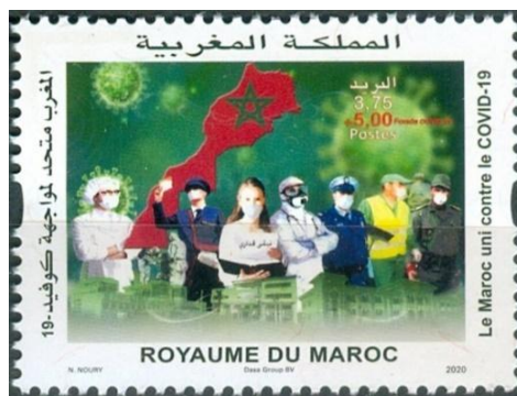
Fig. 13. “COVID-19” stamp, Kingdom of Morocco