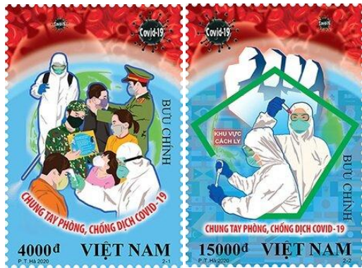
Fig. 4. “COVID-19” stamps, Vietnam

to convey messages of solidarity [16]. The two sets of stamps were issued by the Ministries of Information, Communications and Health, and Vietnam Post Corporation, in a bid to send a supportive message to front-line fighters, and raise citizens' knowledge, responsibility, determination amidst the straining COVID-19 combat [16,17].