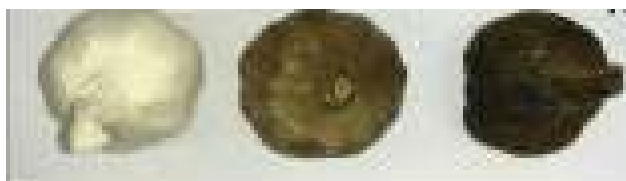
Fig. 2. Aged garlic during the fermentation process (Left to Right)