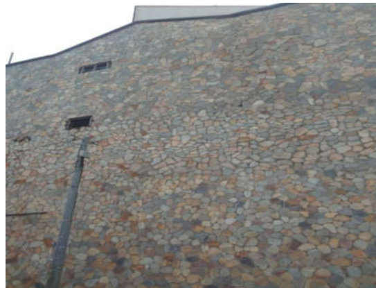
Fig. 1. Photograph of a building of a prestigious School of the trades of the future

No thermophysical characterization of local ornamental stones of granite, marble, and basalt was undertaken. This study carefully addressed these stones with regards to their energy efficiency, coating materials, for durability, aesthetic appearance and finishing for building.