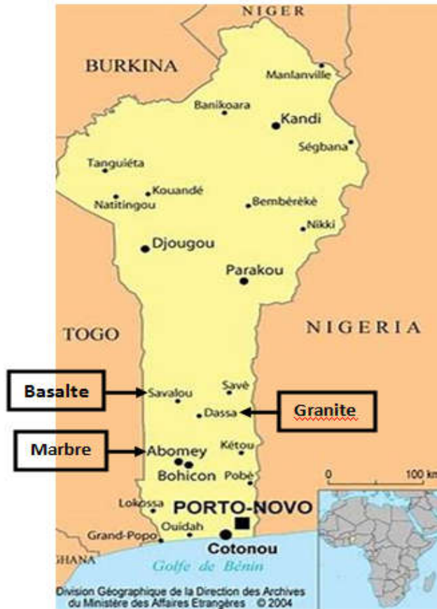
Fig. 2. Geographical map of Benin showing rock sampling sites

element and the temperature is recorded at the center. The system is modeled with a unidirectional heat transfer hypothesis (1D) at the center of the sample during measurement.