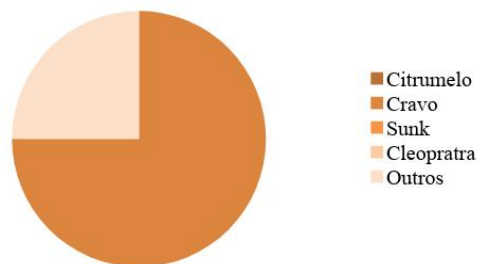
Fig. 3. Principal rootstocks used in the production of citrus seedlings by seedlings producers of Santa Luzia do Induá