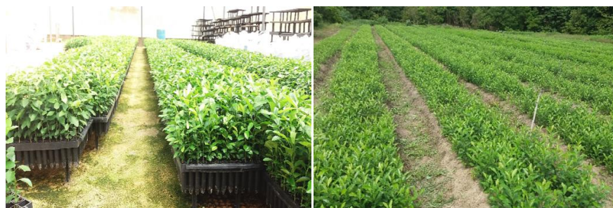
Fig. 4. Harvesting harvested harvester in willows, in the community of Santa Luzia do Induá A- rootstock seedlings cultivated in containers and B- rootstock seedlings cultivated in soil

When asked about the main rootstocks used in the production of citrus seedlings, the producers reported that the most commonly used is the clove lemon tree (Fig. 3). This is due to the preference of the consumers for seedlings grafted with this variety, thus having high demand and appreciation in the market, because it is a rootstock that presents good productivity. Lemon Cravo ( Citrus limonia Osbeck) is the most commonly used rootstock in Brazil, corresponding to about 85% of the rootstocks used by citrus growers. This rootstock is preferred by nurseries and producers due to its characteristics such as: easy seed acquisition, great vigor in the nursery, rapid growth, good planting seedling glue, early production, compatibility with all varieties of canopy, stress tolerance good adaptation to sandy soils [11].