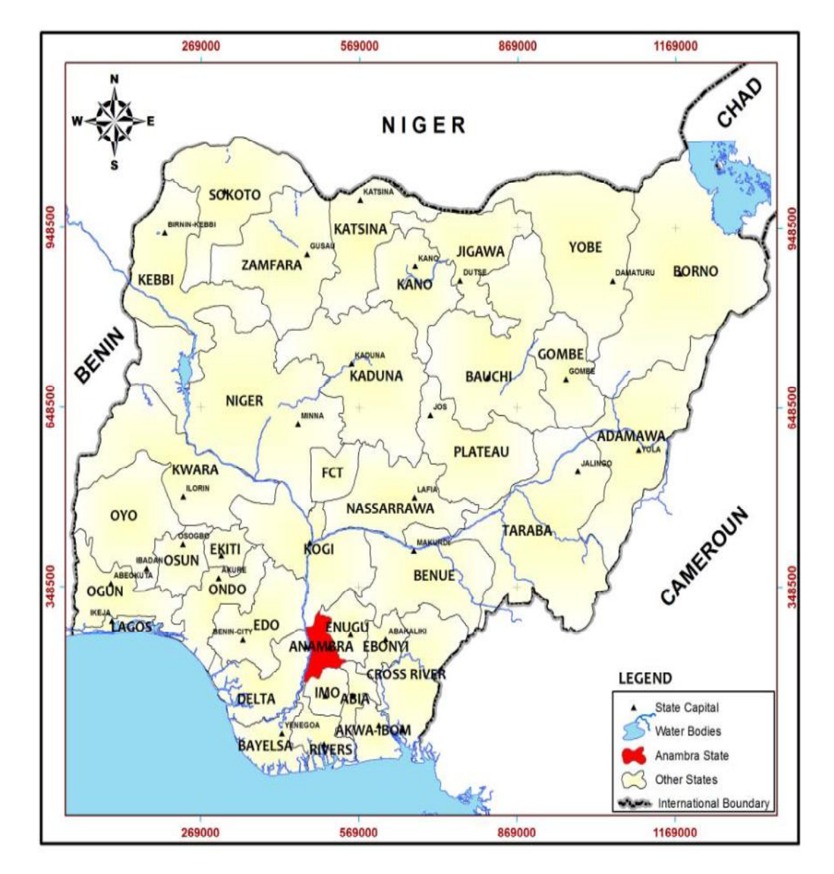
Fig. 1. Map of Nigeria show Anambra State

consists mainly of urban, semi-urban and rural areas. The populate engages in agricultural activities that includes: livestock farming/production, crop production, fisheries etc Livestock such as poultry, goats, and sheep under free range system are kept in the rural areas of the study area. However, the poultry keeping in confirmed system is becoming popular with numerous well established large poultry farms in the urban and semi-urban areas of the state according to statistical report [10].