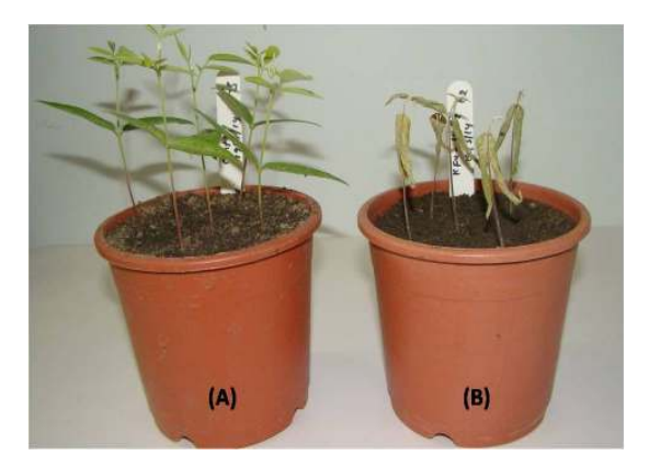
Fig. 1. Plant materials (Whole seedling) collected from healthy (A) and Fusarium wilted (B) Pigeonpea cv. ICP2376 after 7 days of FU inoculation

autoclaved after DEPC treatment. Five standard RNA isolation methods were performed to identify best suited paramount protocol of RNA isolation from pigeonpea and these can be described in the following way.