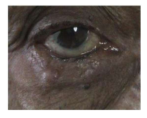
Fig. 3. Stitch indurations and abscess

Except for one case of reoperation which was managed successfully and one stitch (abscess) which responded to medical treatment and other surgical approach, the lid everting silk suture not only caused temporary relief of symptoms, but also it was associated with long time effects. However, two other cases gradually had late recurrences which again properly managed by this simple approach.