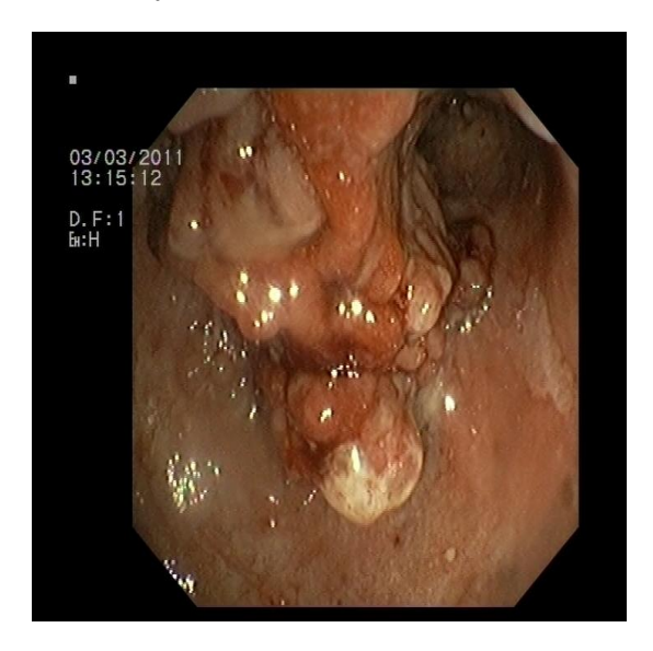
Fig. 3. Colonoscopic findings of obstructing polypoid mass in the sigmoid colon

scintigraphy was also performed, confirming abnormal findings in the sigmoid colon and rectum only.