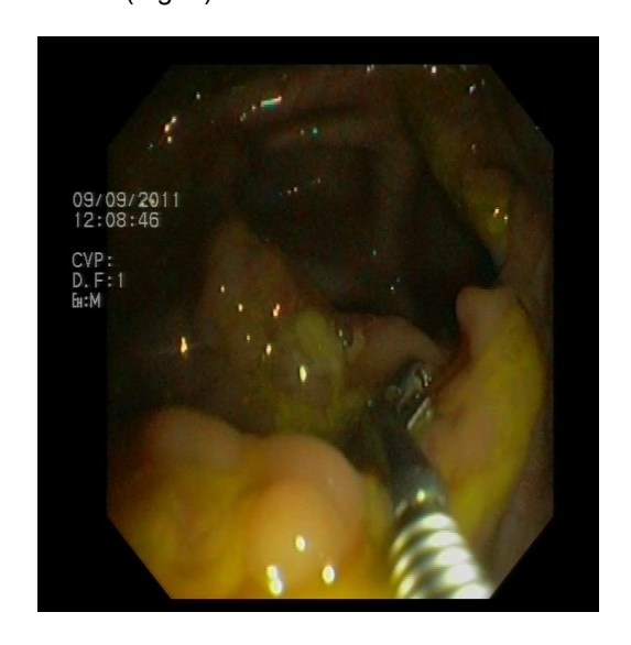
Fig. 1. Colonoscopy findings of the polypoid mass in the transverse colon

mesalazine (now at 4.8 mg /day), mesalazine suppositories and oral beclomethasone (5 mg/day during 1 month). Six months later the mesalazine dose was reduced to 3.6 mg/day. In two follow-up colonoscopies, performed at 6 month intervals, it was seen that the size of the mass progressively decreased. The next colonoscopy was carried out after 1 year, finding IPs, some isolated and others in clusters. These were less than 4 cm in diameter and were found in the transverse colon and splenic flexure, with no mass (Fig. 2).