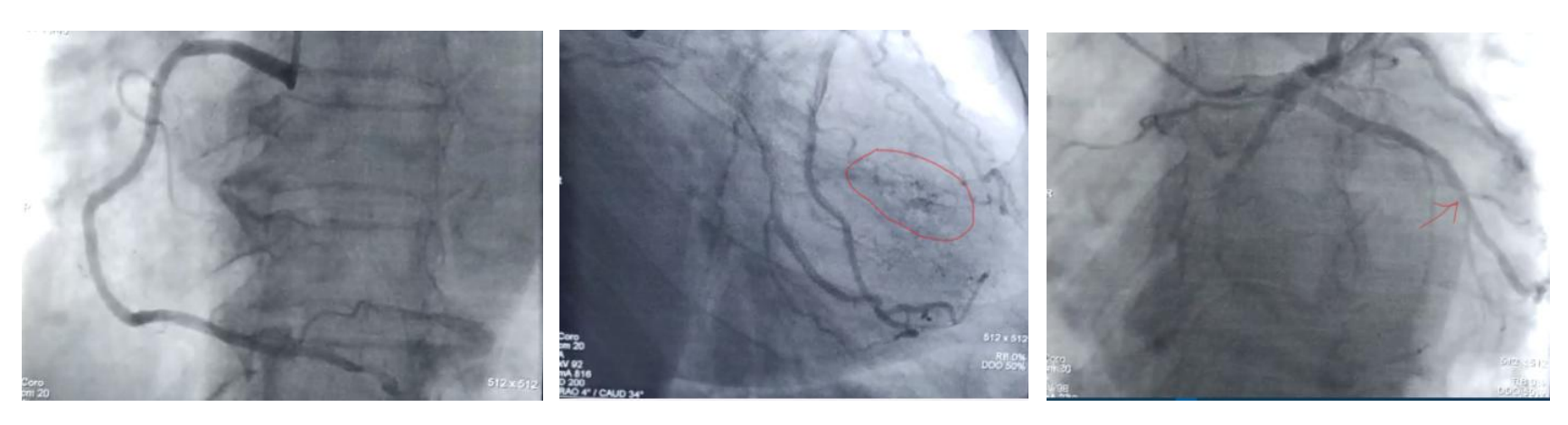
Fig. 3. Coronary angiography images showing a dominant right network free of injury, a fistula of the first diagonal and a non-significant lesion of the middle circumflex