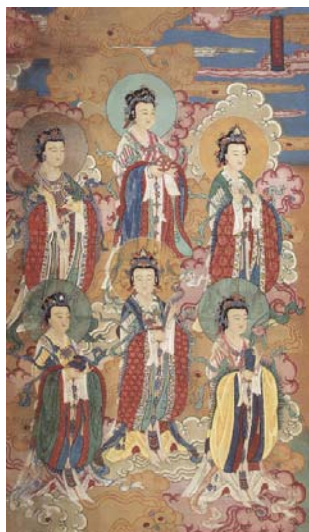
Figure 10. Tiancao Six Gods Images.