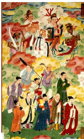
Figure13. Brahman Gods Scholars, Peasants, Workers and Businessmen.