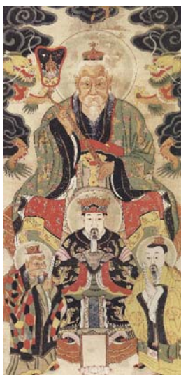
Figure 8. Taiqing Moral God Image. Reprinted with permission from (Hu, Binbin & Wu, Can, 2013)