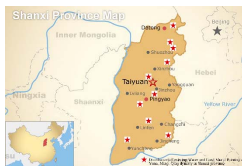
Figure 2. Distribution of existing Water and Land Mural Painting of Yuan, Ming, Qing dynasty in Shanxi province