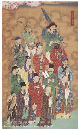
Figure 7. Wang Gu Ceng Dao Ru Liu San Dai Shi Zhu Shi Nong Gong Shang.