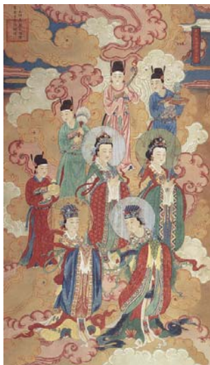
Figure 6. Water and Land Painting named as: Tian Fei Sheng Mu Bi Xia Yuan Jun Xiang. Reprinted with permission from (Editorial Committee of Beijing cultural relics appreciation, 2005)

with board in hands, are in gorgeous clothes and vivid expression. The back and left side of them have four female officers standing. They wear a black gauze folded napkin, decorated with flowers, beaded hair comb, hanging beads earrings. They are dressed in round collar gowns, narrow sleeves, and take the most distinctive robes of the Ming Dynasty, which has a patch on chest and back to distinguish between grades. Robes generally use lighter color, such as light pink, light green and light blue. Bow shoes are decorated with small golden flowers. The palace costume is the same as that of the Song dynasty. The characterization is exquisite, vivid and natural. They hold censer, Ruyi, fan and jade seal, following the four women. This Water and Land Painting vividly presents the lightness and elegance of women's clothes of the time. This image data reflects the beauty of the overall dynamic clothing.