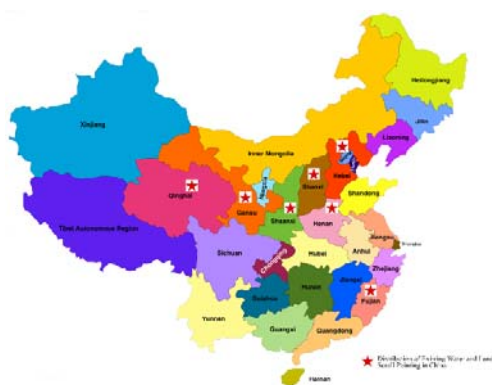
Figure 3. Distribution of Existing Water and Land Scroll Painting in China