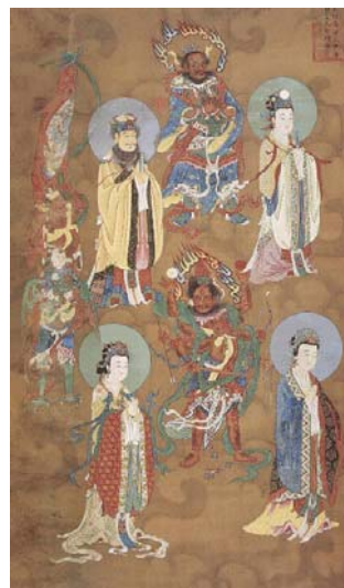
Figure 11. Six Gods Images.