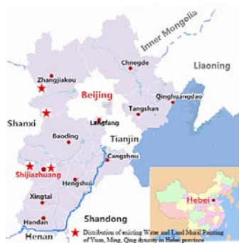
Figure 1. Distribution of existing Water and Land Mural Painting of Yuan, Ming, Qing dynasty in Hebei province

The preserved Water and Land Mural Painting are mainly distributed in the northern part of China. The Water and Land Mural Paintings of the Yuan, Ming and Qing dynasties are distributed in Hebei and Shanxi Provinces (Huang, 2006, p. 107) (see figure 1 and 2). In Hebei, it is available in Zhaohua Temple of Huaian county of Zhangjiakou, Gucheng Temple and Zhongtai Temple of Wei County, Jueshan Temple of Guyue Town of Pingshan County and Pilu Temple of Shijiazhuang City. In Shanxi, Water and Land Mural Paintings are preserved in Qinglong Temple of Jishan County, Guangsheng Temple of Hongdong County, Zishou Temple of Lingshi County, Yunlin Temple of Yanggao County, Princess Temple of Fanzhi County, Yongan Temple of Hunyuan County, Wenshu Temple of Taihuai Town of Wutaishan City, Yuanzhi and Jingxin Temple of Taigu County, Jixiang Temple of Lingchuan County and the north Buer Temple of Taiyuan City. It also exists in other provinces, such as Xingfo Temple of Gongyi City of Henan province, Shengshou Temple of Dazu District of Chongqing City and etc.