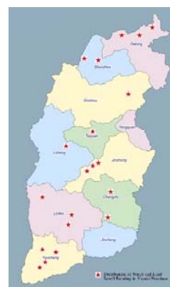
Figure 4. Distribution of Water and Land Scroll Painting in Shanxi Province

The preserved Water and Land Scroll Paintings are mainly come from the Ming dynasty and the Qing dynasty (Huang, 2006, p. 99) (see figure 3 and 4). From the north to the south and from the east to the west, the water-and-land scroll painting is distributed in Gansu, Qinghai, Beijing (Capital Museum and Palace Museum