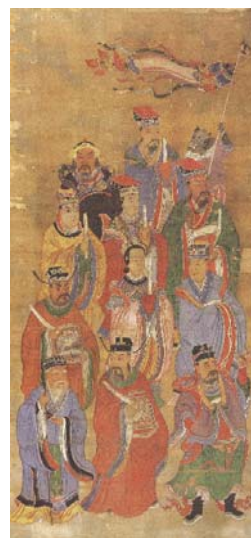
Figure 9. The God Images of Taoism.

Underneath the picture are officials and scholars. The left one is wearing an unfolded foot headwrap and Tuan gown with a round collar. The official robes place the gayer patch in the chest and back area to distinguish rank