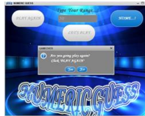
Fig. 10. Player clicks on "YES", the "PLAY AGAIN" can click on