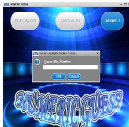
Fig. 5. Default Range Play Window