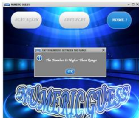
Fig. 11. Player enters a number greater than the range