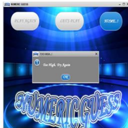
Fig. 7. Number of players' riddle is greater than the exact number