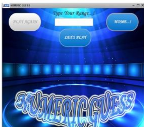
Fig. 3. User Selection Range