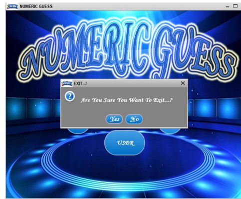
Fig. 13. Player must comply if player must exit window