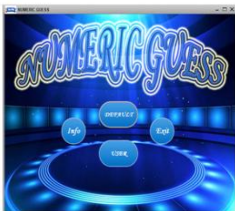
Fig. 1. Welcome Window

To check the probability of people interested in playing digital games, we randomly selected a number of people with no age limit. About 100 people, over 80% of people enjoy to playing Numeric Guess.