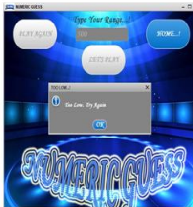
Fig. 8. Number of players' guessing is less than the exact number