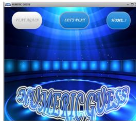
Fig. 2. Default Range Window