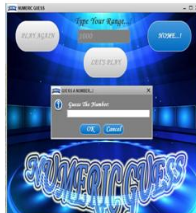
Fig. 6. User Selection Range Play Window