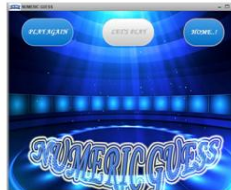
Fig. 12. Player clicks "NO", expect "HOME", the other buttons will be disabled