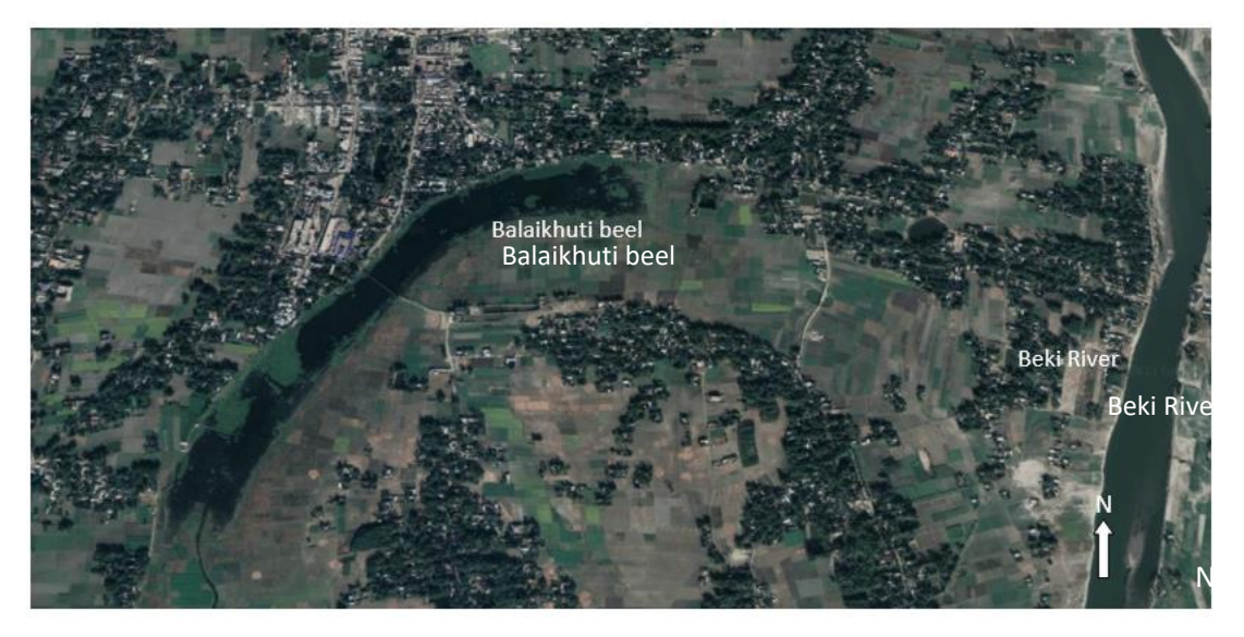
Fig. 1. An aerial view of Kalgachia Town showing Balaikhuti Beel and Beki River (Google Maps/Google Earth; Imagery from the dates:9/29/2023–3/29/2024)

The study area, Balaikhuti Beel (26^{\circ}20'56'' - 26^{\circ}21'06'' N and 90^{\circ}51'54'' - 90^{\circ}52'33'' E; 45m above msl) is a dormant tributary of the Beki River, covering an area of 1.25 km<sup>2</sup>. The beel reaches depths of 4 - 5m in summer and 2 - 3m in winter. During the monsoon, the waterbody expands to cover up to 3 km<sup>2</sup>. Presently, the beel is facing various stressors, including a reduction in area, shallowing of the waterbody, and pollution.