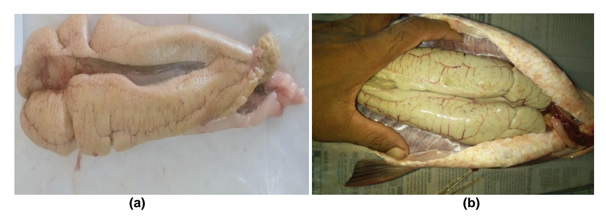
Fig. 1(a&b). Showing matured ovary inside and outside of abdominal cavity of Labeo rahita