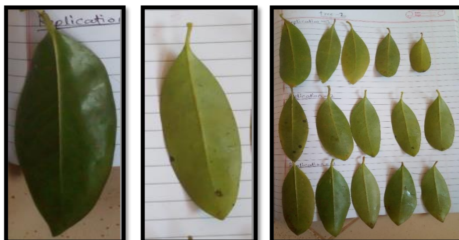
Picture. 1. Leave selected to analyse for shape, colour and other parameter