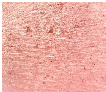
Fig. 4. 40X magnification - ground section of the OP compound immersed natural tooth showing prominent dentinal tubules