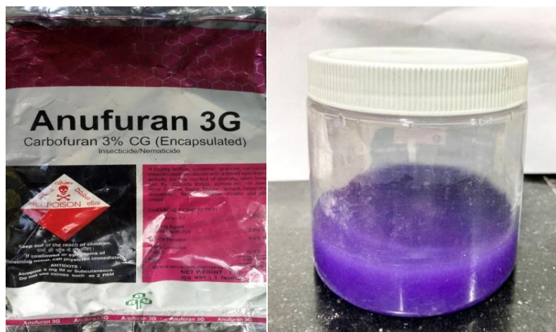
Fig. 1a. The commercially available OP compound used in this assessment Fig. 1b. The OP compound solution – 1g in 100ml of distilled water; purple color

Pulp: The pulp was completely lost in OP compound exposed tooth, hence couldn't be assessed.