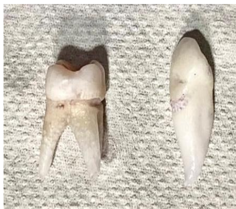
Fig. 2. Shows a newly extracted natural tooth that was exposed to an OP compound solution for an hour. The cervical region and the apical 1/3rd of the tooth have a slight purplish tint.