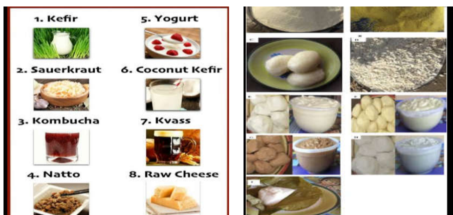
Fig. 1. Common forms of probiotic foods

contain numerous immune-stimulants such as; proteases, \beta -glucans and manna oligosaccharides that function in detoxification of the immune system. S. cerevisiae exerts probiotic effects by promoting metabolic processes of digestion and nutrient utilization. It also maintains the gastrointestinal tract's flora by excluding pathogens and increasing the population of useful microbes. Sacchramomyes boulardii stimulates immune response by secreting proteolytic enzymes that degrade bacterial toxins and inhibit their adherence to gastrointestinal epithelial cells [35].