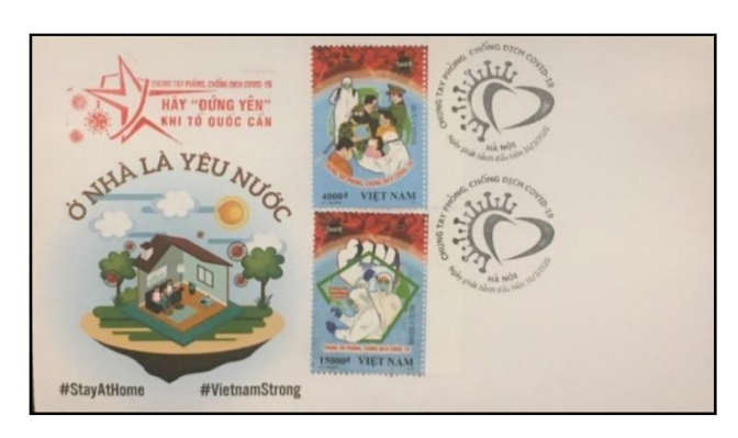
Fig. 6. "COVID-19" postal cover, Vietnam