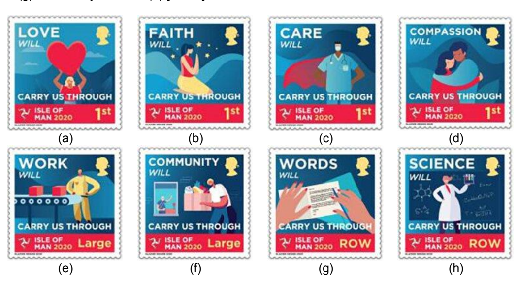
Fig. 11. "COVID-19" stamps, Isle of Man

Another interesting postal stamp is the one emitted on 10.05.2020 by United Arab Emirates (UAE) postal administration. The stamp in sheet -