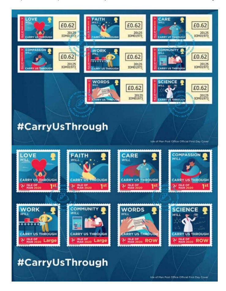
Fig. 12. "COVID-19" first day cover, Isle of Man

disappointment remains that even at this time the Romanian postal administration (Romfilatelia) has not yet issued any postage stamp on this subject. Until now, we do not know that this topic will be addressed by other researchers in the field of philately. The way we chose to structure the information we consider to offer originality to the work and reflect our way of expression.