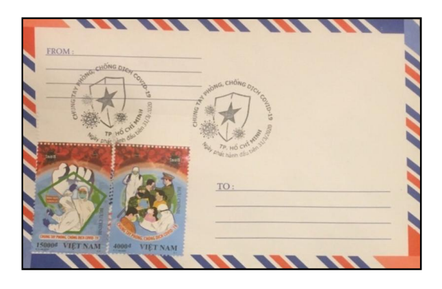
Fig. 7. "COVID-19" postcard, Vietnam