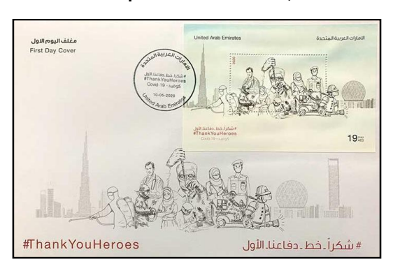
Fig. 15. "COVID-19" first day cover with souvenir sheet, United Arab Emirates