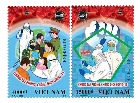
Fig. 4. "COVID-19" stamps, Vietnam

to convey messages of solidarity [16]. The two sets of stamps were issued by the Ministries of Information, Communications and Health, and Vietnam Post Corporation, in a bid to send a supportive message to front-line fighters, and raise citizens' knowledge, responsibility, determination amidst the straining COVID-19 combat [16,17].