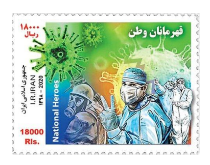
Fig. 3. "COVID-19" stamp, Iran

Coronavirus", according to other sources - as shown in Fig. 3 [12,13] - was unveiled by President H. Rouhani during a ceremony broadcast by Iranian state news.