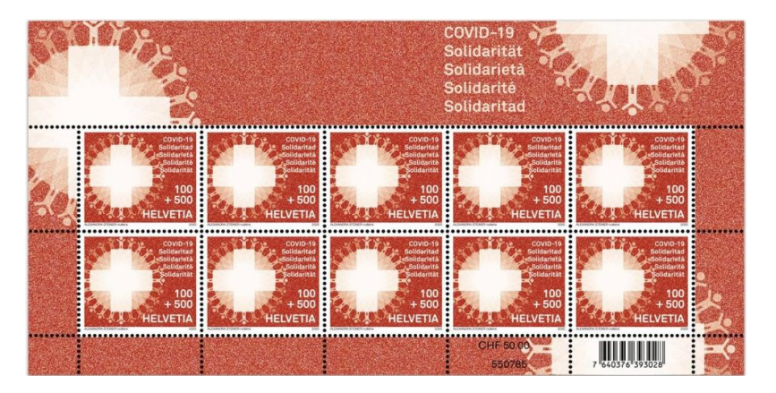
Fig. 9. "COVID-19" booklet of 10 semi-postal stamps, Switzerland

After Iran, Vietnam and Switzerland unveiled their COVID-19 stamps to the world, more and more coronavirus issues have been released by Isle of Man, Kingdom of Morocco, United Arab Emirates and so on [25].