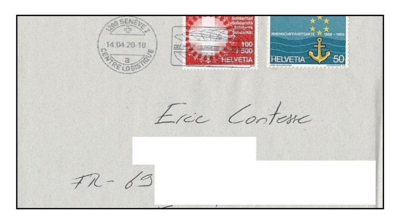
Fig. 10. "COVID-19" circulated issue, Switzerland-France, 14 April 2020