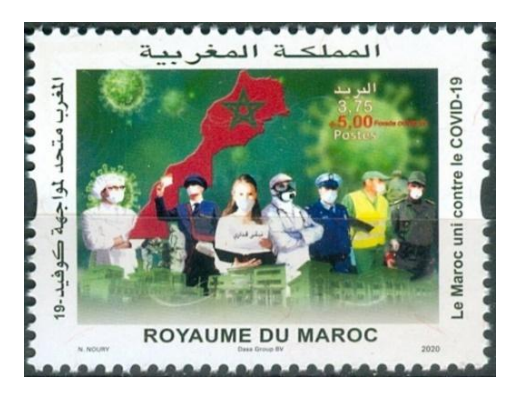
Fig. 13. "COVID-19" stamp, Kingdom of Morocco