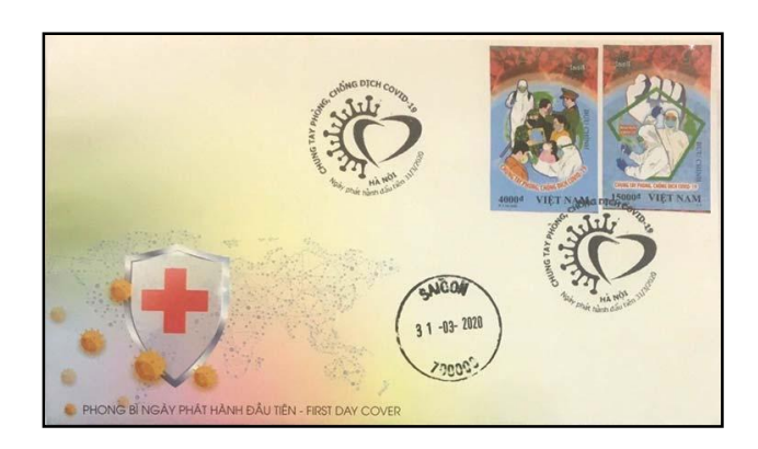
Fig. 5. "COVID-19" first day cover, Vietnam