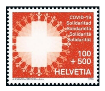
Fig. 8. "COVID-19" stamp, Switzerland

The "COVID-19 Solidarity" stamp reflects Swiss Post's commitment to the society cohesion. Proceeds will go to Swiss Solidarity and the Swiss Red Cross [23]. It is a way for you to support those in urgent need of help.