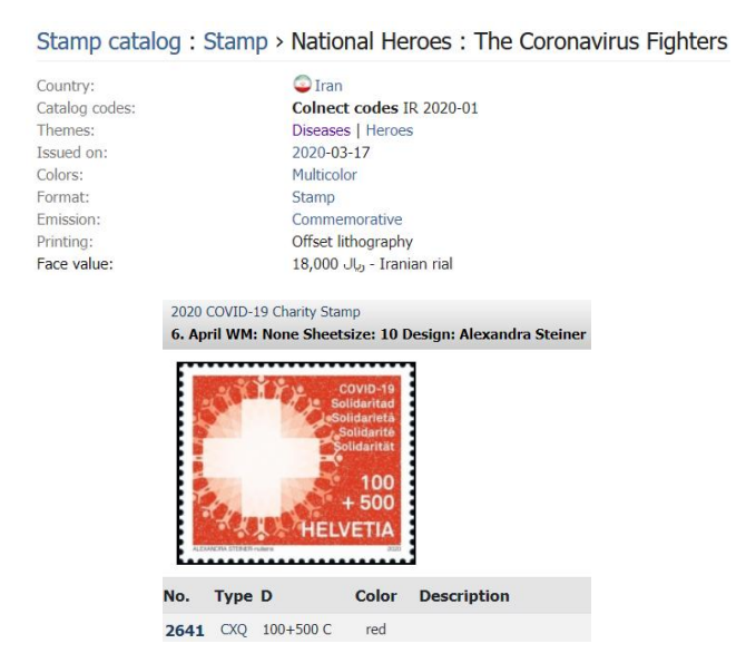
Fig. 1. Searching for "COVID-19" stamps via colnect and stamp world platform

An extremely important notion, for the following approaches, which subscribes to the modern philately area, is the notion of stamp. As it was natural, the stamp appeared and developed over time as a result of highlighting common features and behaviors for a number of processes and phenomena in different areas of activity.