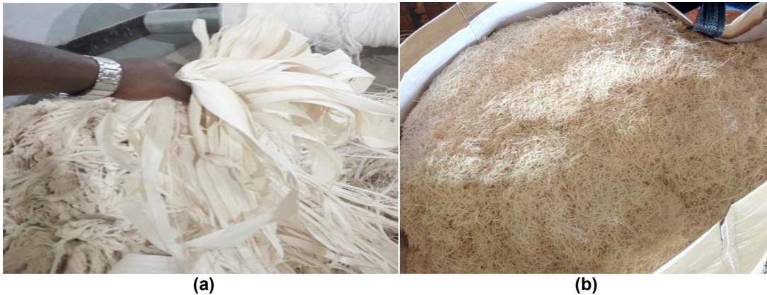
Fig. 1. CY waste samples (a) bulk sample (b) cut into small pieces

From which P is the vapour pressure in mmHg and T is the temperature at the ambient space ( ^\circ\text{C} ).