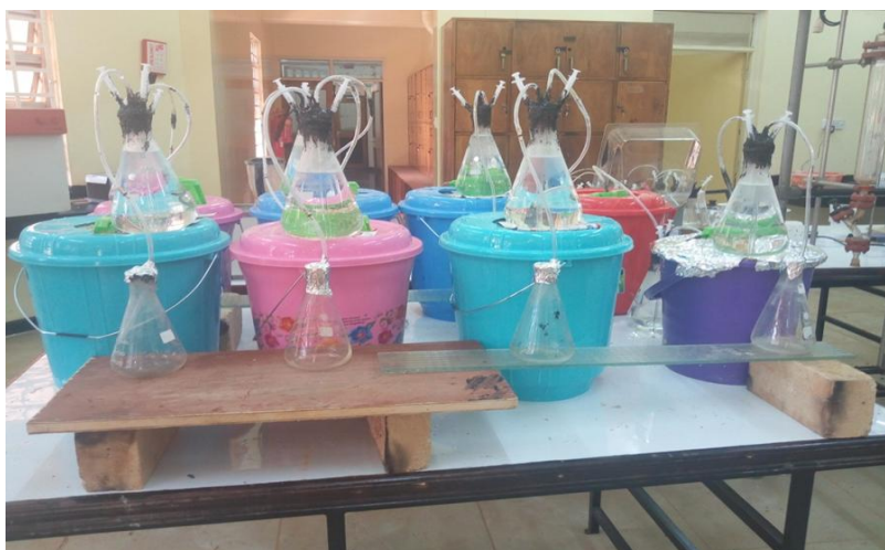
Fig. 3. Full biogas set up