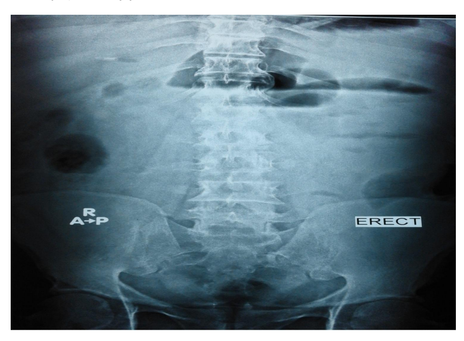
Fig. 1. Abdominal X-ray

Computed tomography of the abdomen (Fig. 2) showed intestinal obstruction with filled defects with contrast as diverticulae of small bowel.