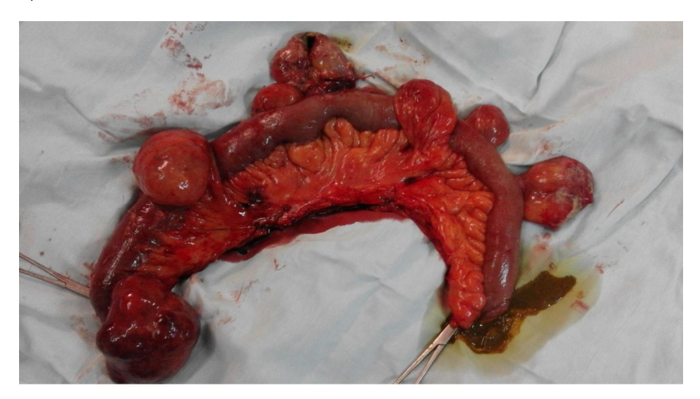
Fig. 4. Multiple giant jejunal diverticula

To our knowledge, this is the first case we have encountered and documented in Kasr Alainy. Usually jejunal diverticulae are asymptomatic and commonly discovered accidentally on radiological study or during autopsy [10]. Nonetheless, it could be presented with complication as obstruction, hemorrhage and diverticulitis perforation in 10-30% of the cases as in our case where one of the diverticulae was found perforated.