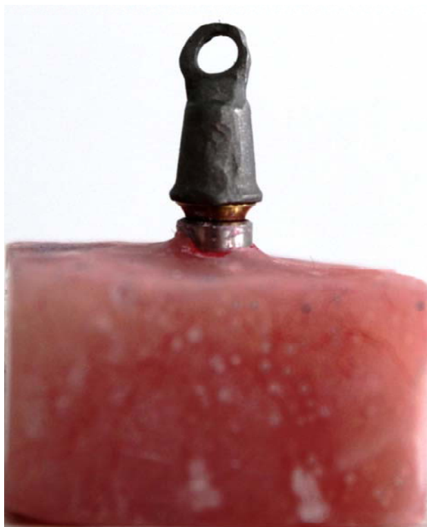
Figure 3. The casting with a loop attachment.

machine (Zwick CombH- & Co/Roell.Z020, Ulm, Germany) by clamping them directly onto the loop attachment. The machine was used to apply vertical tensile forces at a crosshead speed of 5 mm per minute, to dislodge the castings from the abutments. The peak load to dislodgement was documented (N) and used to indicate the retentive values. Before testing each new casting, abutments were cleaned of remaining cements. To compare the groups, one-way analysis of variance (one-way ANOVA) and pairwise comparisons test (LSD) were used.